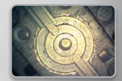
Center Weighting On